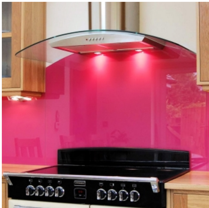
Extractor Fan Fitted to Curved Glass Panel

You may fit your extractor fan to the top of a curved or flat glass splashback.