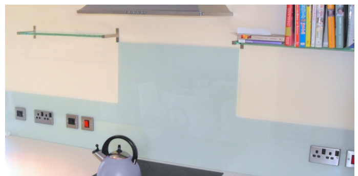
"T" Shaped Glass Splashback Behind a Hob

A. Yes the glass splashbacks and splashback coating are heat resistant and will not crack behind the hob. Please see our Toughened Glass Splashbacks Page for more information.